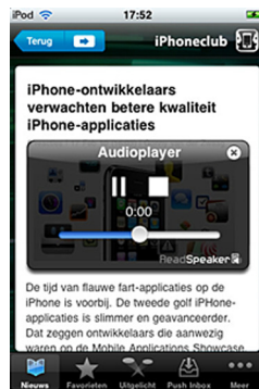
iPhoneClub* Benelux Region