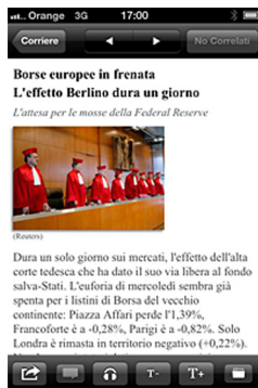
Corriere della Sera* Italy